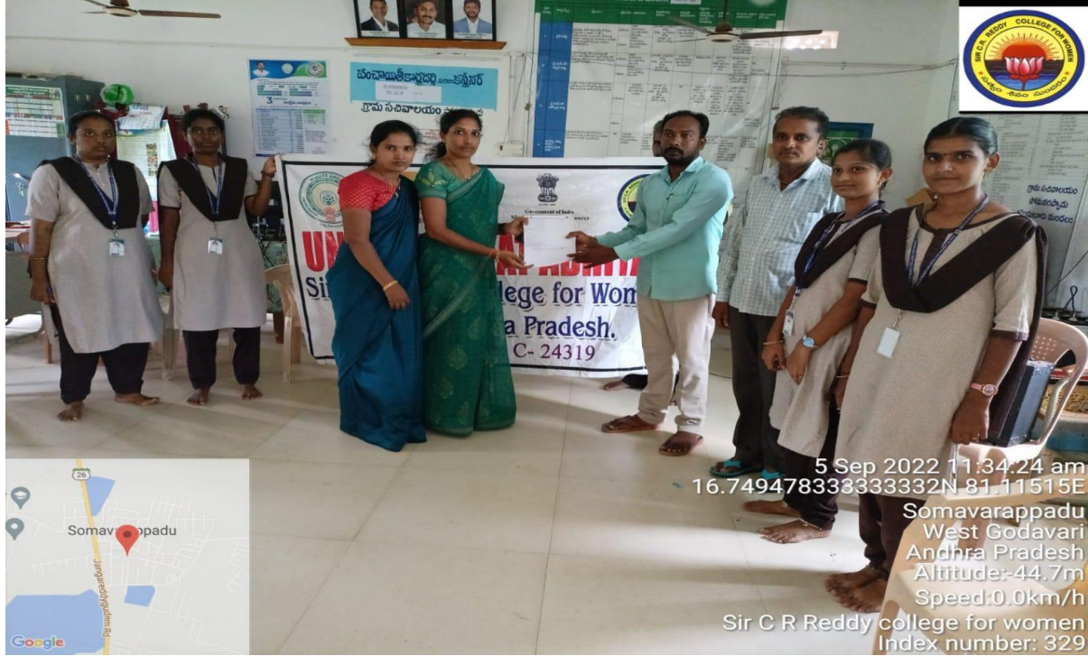
Survey on somavarappadu